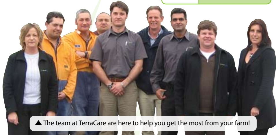
▲ The team at TerraCare are here to help you get the most from your farm!

TerraCare are proud sponsors of the Waikato Valley Cricket Association